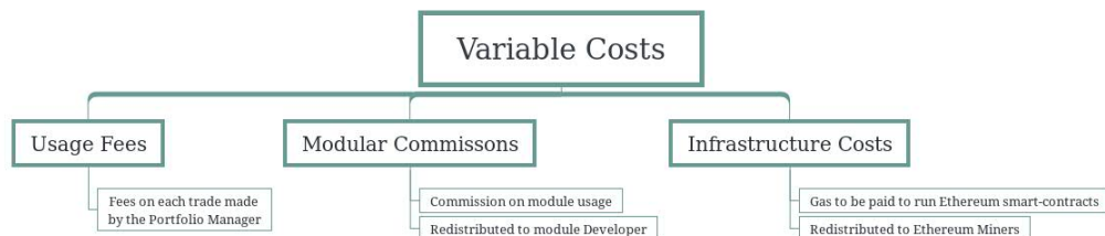
FIGURE 2. Variable Costs of a Melon protocol portfolio

In conclusion, the Melon protocol is an open-source blockchain protocol. Portfolio track-records and performances are visible and auditable by everyone.